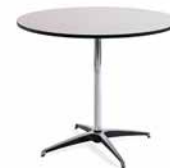
30" Pedestal Table #50032 30" x 36" Pedestal Table, Grey Fleck Top, Chrome Base