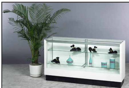
4' Full View Showcase #50067