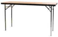
Display Table #50045 6' x 24" x 42" Unskirted