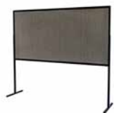
Horizontal Tackboard #50060 4' x 8' Black Legs, Grey Fabric