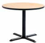
30" Natural Pedestal Table #50706 30" x 36" Natural Feel Pedestal Table, Maple Top, Black Base