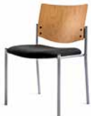
Natural Feel Chair #50704 Light Maple Back, Black Fabric Seat