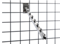
7-Ball Waterfall Grid Attachment #50242 Silver Also Available for Slat Wall #50243