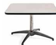
Square Side Table #50031 18" x 18" x 24"