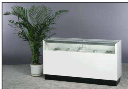
4' Quarterview Showcase #50069