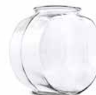
Drawing Bowl #50185