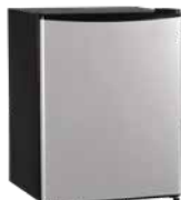
Mini Refrigerator #50098