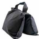
Sand Bag #51087