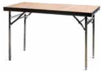
Display Table #50040 4' x 24" x 30" Unskirted