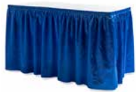
Display Table #50042 4' x 24" x 30" Skirted

6' and 8' Long Tables are Skirted on 3 Sides. For Skirting on 4 Sides, please order 4th Side Skirt.