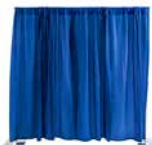
8' High Drape #50074