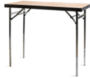
Display Table #50041 4' x 24" x 42" Unskirted