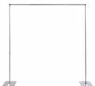
8' High Upright with Base #50088 Crossbar rented separately