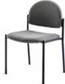
Upholstered Side Chair #50020 Upholstered Side Chair, Grey Fabric