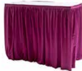
Display Table #50043 4' x 24" x 42" Skirted