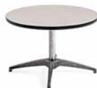
Round Side Table #50030 18" x 24"